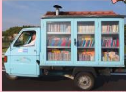
THE TINY LIBRARY BRINGING BOOKS TO REMOTE VILLAGES