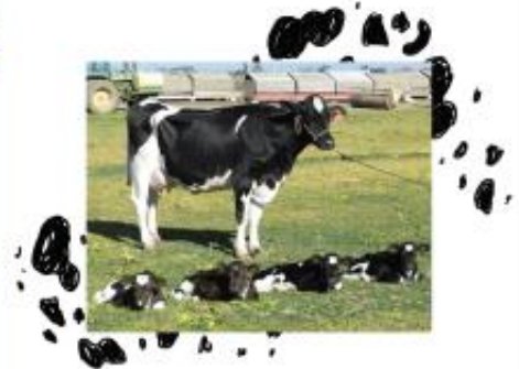
COW GIVES BIRTH TO QUADRUPLETS EENY, MEENY, MINEY AND MOO

a 100-YEAR-OLD TORTOISE called DIEGO SINGLE-HANDEDLY saved his own SPECIES from EXTINCTION by fathering 800 offspring!