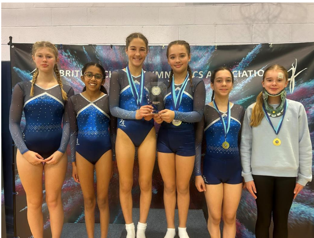
The Year 10-14 teams all won medals and trophies.